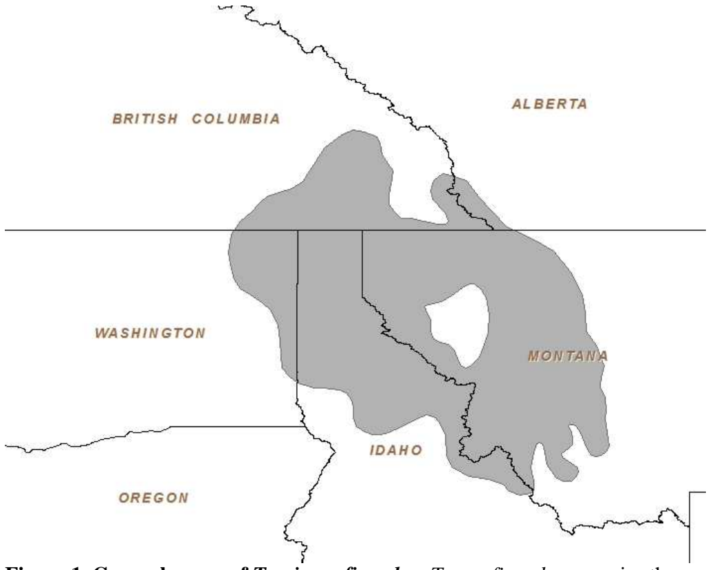
Figure 1. General range of Tamias ruficaudus . T. r. ruficaudus occupies the eastern half of the range, and T. r. simulans occupies the western half including WA with small zones of overlap in ID and MT. (Source: <a href="http://maps.iucnredlist.org/map.html?id=42577">http://maps.iucnredlist.org/map.html?id=42577</a>)